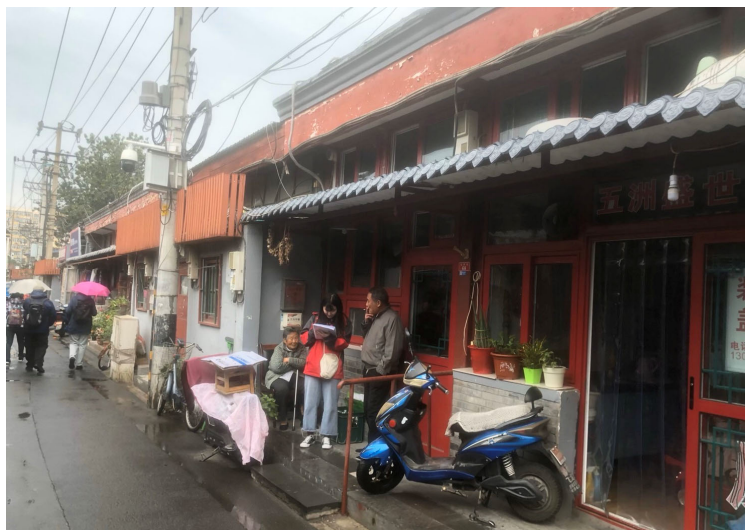
Actual survey and interview in china.

I am studying the townscape formation of Nakasendo's town. The current townscape was a phenomenon that formed by adding buildings along the road. My research is to show that it is influenced by human's awareness of the townscape. This phenomenon was found some Nakasendo's town. I could proved by my research . Then ,I think that if humans have different consciousness of cityscape, the townscape formation will be different . I found that it seems same type building in china. So I compared Nakasendo's town with china. And I conducted actual survey and interview. I was helped my friend when I interview.