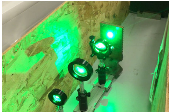
Fig1. The experimental setup for laser focusing.