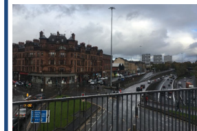
Fig 3. City landscape.

University of Glasgow is fourth-oldest university in UK and has historical buildings. I often walked around campus and the Glasgow city centre at the weekend to see the historical buildings designed by architect, Charles Rennie Mackintosh. As there were many international students in an aerospace engineering lab where I visited, I could talk different cultures.