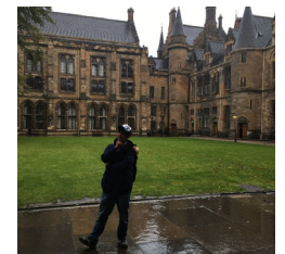
Fig 4. College courtyard.