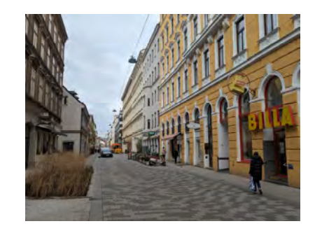
Fig. 1 Shared Space in Vienna

My Research Topic is Shared Space. Shared Space is the road used by both cars and people(Fig.1). On this road, pedestrians and cars coexist, and the border between the roadway and the sideway is nothing or weak. And they remove signs and traffic-light intentionally to make aware that the road is not only for cars but also pedestrians. Then they change the road to be a space that pays attention to each other about transportation. This method offers the advantage that is safer and more comfortable than the other community road and leads to the activation of locomotor activity. So what about the real ability about safe or comfortable? From the Previous Research, there are effects or manuals about Shared Space, but there is little research about validity. Some research about validity uses only the subjective method like a questionnaire survey and does not use the objective method. Therefore we survey the validity of Shared Space by the objective method. In this method, we focus on only the comfortable of Shared Space. And we have redefined the meaning of comfort so that pedestrians can freely use the all road space. If this is the case, we hypothesized that the presence of pedestrians in the roadway area would be related to comfort. We then conducted a survey focusing on the behavior of pedestrians on the road-